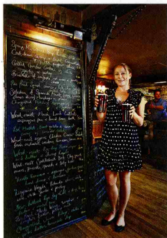
CHEERS! Beers on tap—and hearty meals—are served at the Griffin Inn, at Fletching in East Sussex.

The country code for the United Kingdom is 44. Prices quoted are for October 2011.